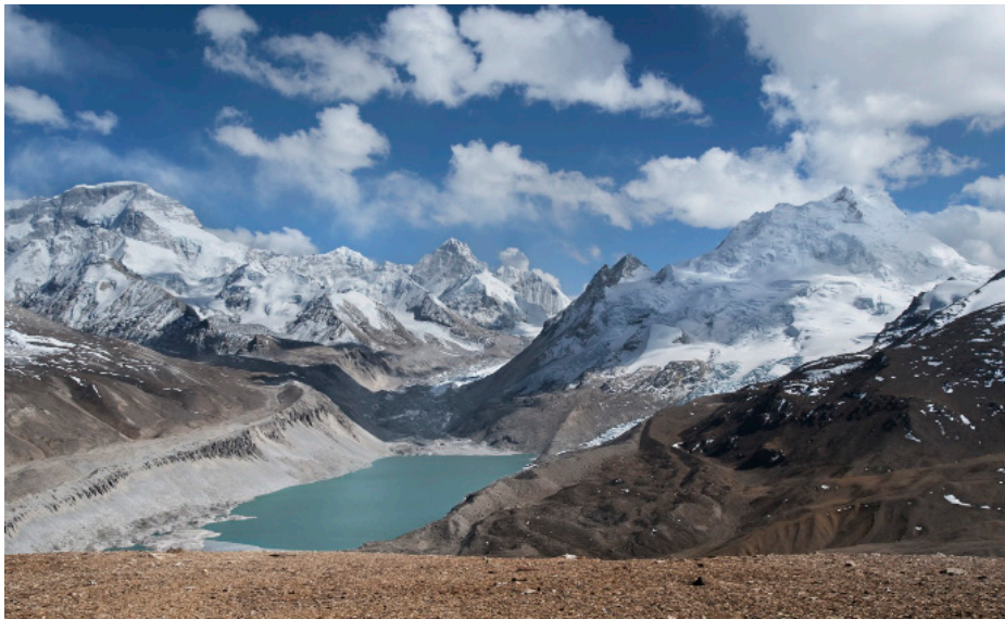
Kyetrak Glacier 2009